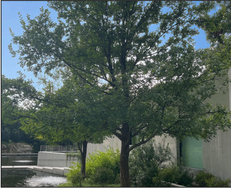
Established cedar elm tree