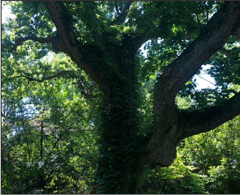
Mature chinkapin oak nestled in a lush landscape