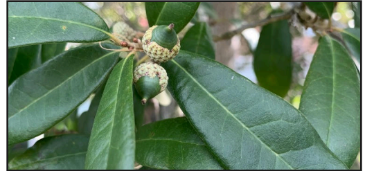
Leaves & acorns