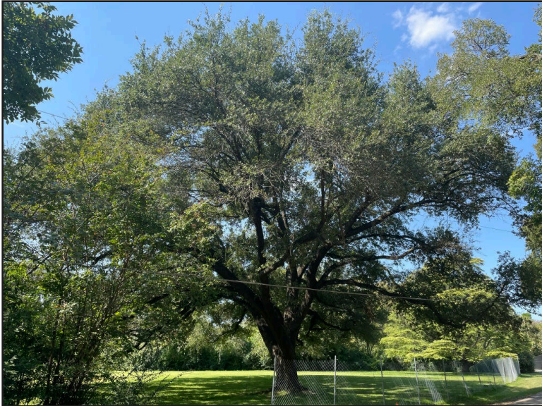
Mature live oak tree